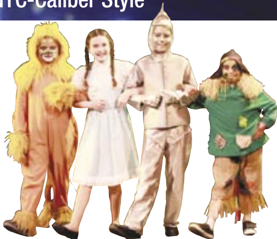
Westchester Sandbox Theatre caters to young performers who dream of making it big some day.